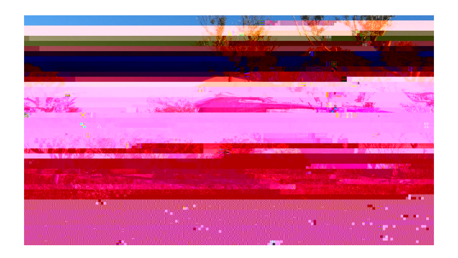
Photo Description: Description: Rearview of building. (Date: 10/07/2014, T. Henkel)