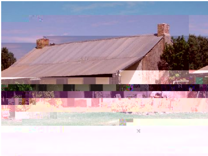
Photo Description: 9/12/2004 Henkel Front (north) elevation of cottage

Map Walkaway GPS 6793428.00 GPS 283151.000 Reference: S.W. Northing: 0000 Easting: 000