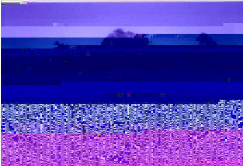
Photo Description: 9/12/1997 Suba, Callow and Grundy Concrete remains