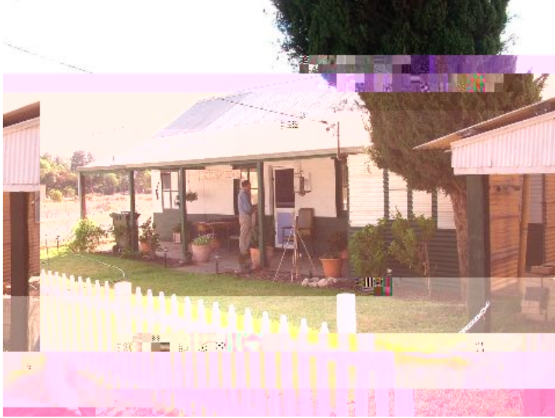
Photo Description: View from Padbury Road. (Date: 29/03/2005, Dameon and Martin)