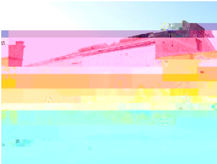
Photo Description: 22/05/2010 Tanya Henkel View of Hall from Fitzgerald Street.

Map Reference: GPS Northing: 6814506.00 0000 GPS Easting: 266396.000 000