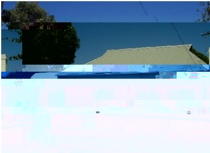
Photo Description: 31/10/2007 Rod Milne Cottage with addition to side.

Map Reference: 14.14 GPS Northing: 6813793.00 GPS Easting: 266111.000 0000 000