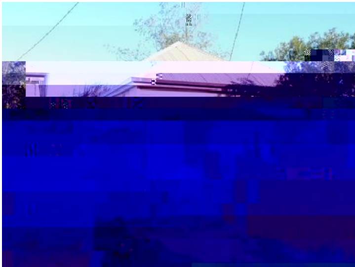
Photo Description: 6/08/2008 Tanya Henkel House set behind front brick wall.

Map Reference: 15.17 GPS Northing: 6816088.00 GPS Easting: 267304.000 0000 000