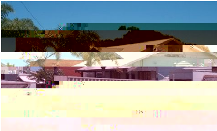
Photo Description: 29/10/2007 Rod Milne Gable roof with feature gablet to front.

Map Reference: 15.17 GPS Northing: 6816047.00 GPS Easting: 267293.000 0000 000