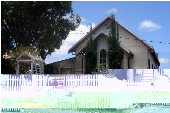
Photo Description: 30/11/2007 Rod Milne Former Seventh Day Adventist Church, front facade.

Map Reference: 14.14 GPS Northing: 6813753.00 GPS Easting: 266516.000 0000 000