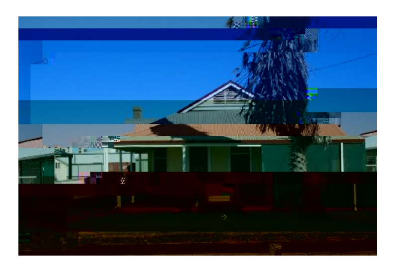
Photo Description: 22/10/2007 Rod Milne One of a matching pair of adjacent houses