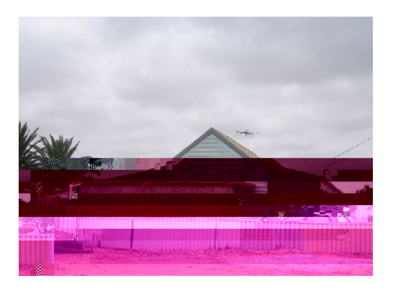
Photo Description: 18/01/2008 Rod Milne Simple structure with new cladding.

Map 16.2 GPS 6820216.00 GPS 268237.000 Reference: Northing: 0000 Easting: 000