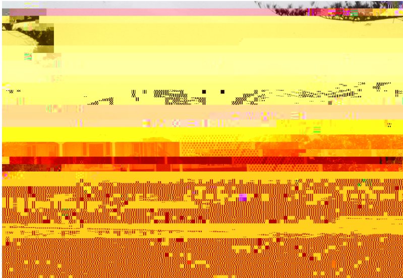
Photo Description: 6/11/1996 Suba & Grundy Tall chimneys punctuate the roofscape.