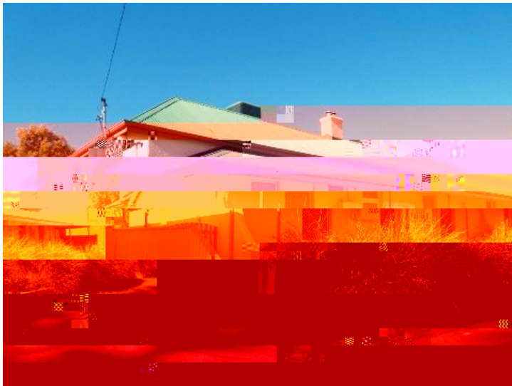
Photo Description: fi#łŽ3łł ŽfiŽ 1" ~ 5" / ~ ~ 6" ! 7" 8" 9, + ~ ~ / * : ! ; 4