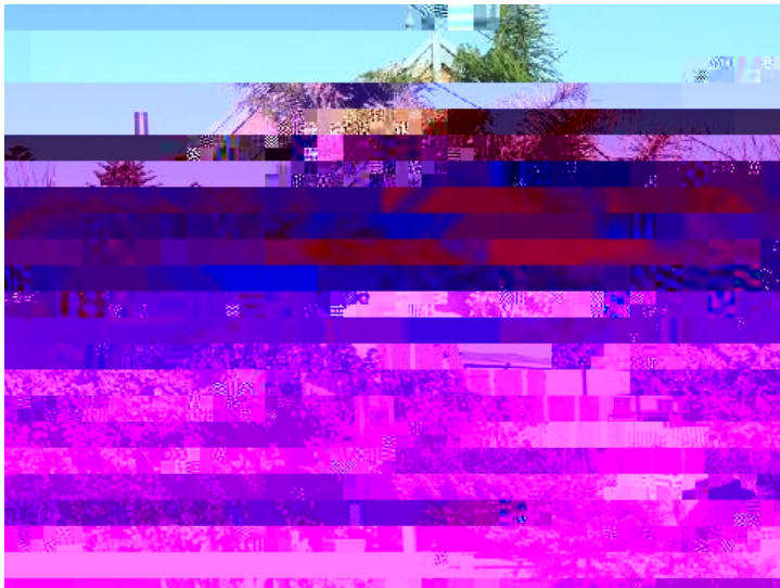
Photo Description: 13/04/2008 Tanya Henkel Steeply pitched gable roofed building.

Map Reference: 14.15 GPS Northing: 6814384.00 GPS Easting: 266111.000 0000 000