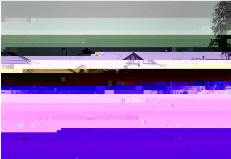
Photo Description: 25/10/1996 Suba & Grundy Tall chimney punctuates roofscape.