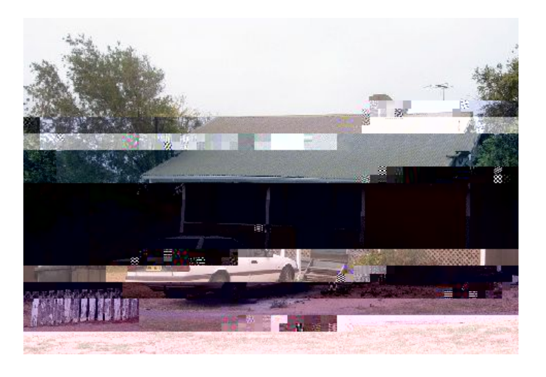
Photo Description: 13/11/2007 Rod Milne Small weatherboard cottage.

Map 14.14 GPS 6813795.00 GPS 265770.000 Reference: Northing: 0000 Easting: 000