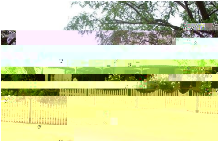
Photo Description: f$flfllžl 1 & 3# ~ / ( 4 ~ . 4 6" / ~ 0# °° 4" / 7" °° ~ ~ 1/8" 0 ~ , 2