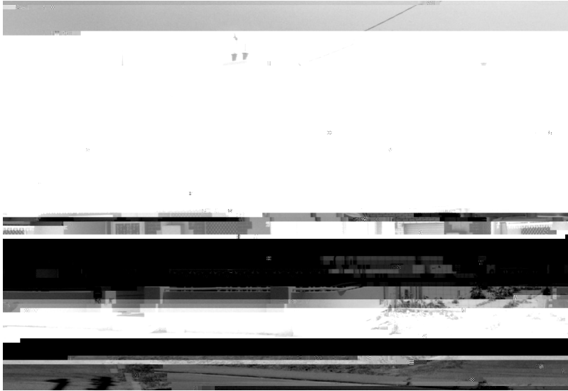
Photo Description: 14/10/1996 Suba & Grundy Tall chimneys a feature.