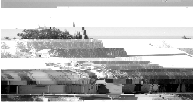
Photo Description: 14/10/1996 Suba & Grundy View showing decorative veranda brackets.