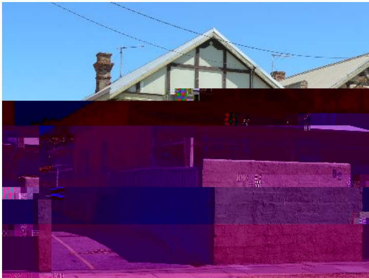
Photo Description: 13/04/2008 Tanya Henkel Set behind a high brick fence.

Map Reference: 14.15 GPS Northing: 6814218.00 GPS Easting: 266226.000 0000 000