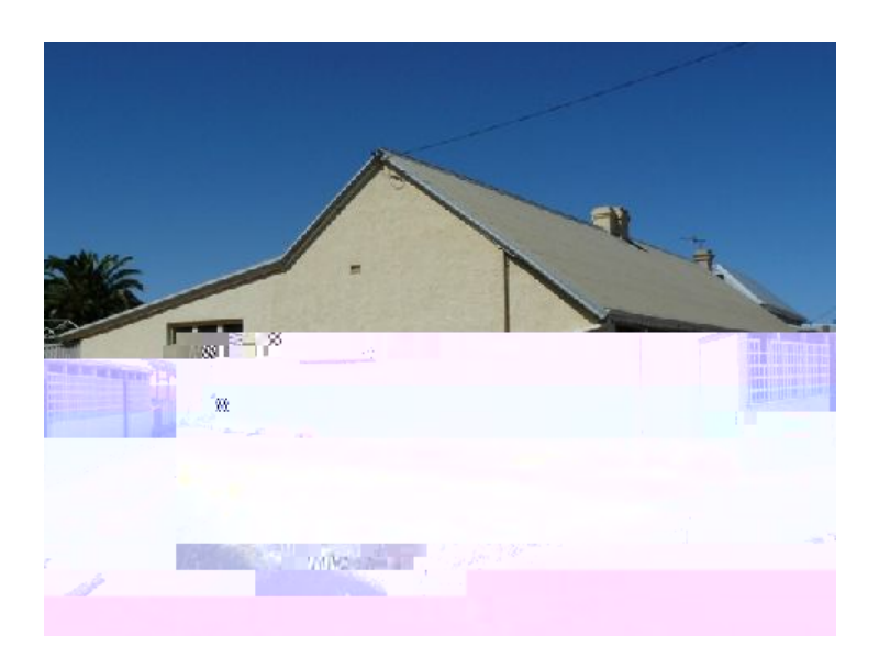
Photo Description: 13/04/2008 Tanya Henkel View showing steeply pitched roof.

Map 14.15 GPS 6814232.00 GPS 266284.000 Reference: Northing: 0000 Easting: 000