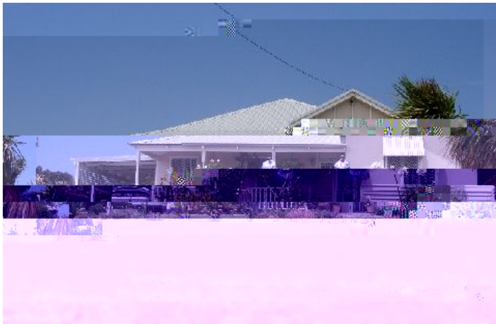
Photo Description: 14/11/2007 Rod Milne Set above the street level

Map Reference: 15.14 GPS Northing: 6813387.00 GPS Easting: 267632.000 0000 000