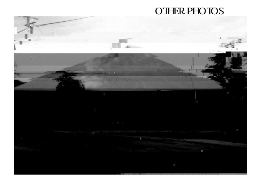
Photo Description: 5/11/1996 Suba & Grundy Surrounding verandahs a feature.