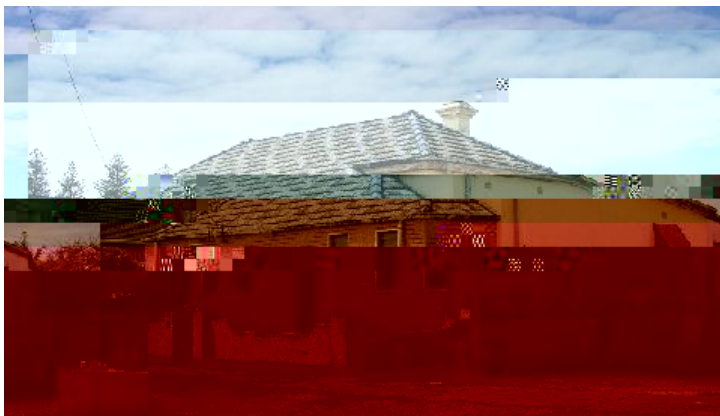
Photo Description: 15/10/1996 Rod Milne View of north and west elevations.

Map Reference: 14.14 GPS Northing: 6814074.00 GPS Easting: 266245.000 0000 000