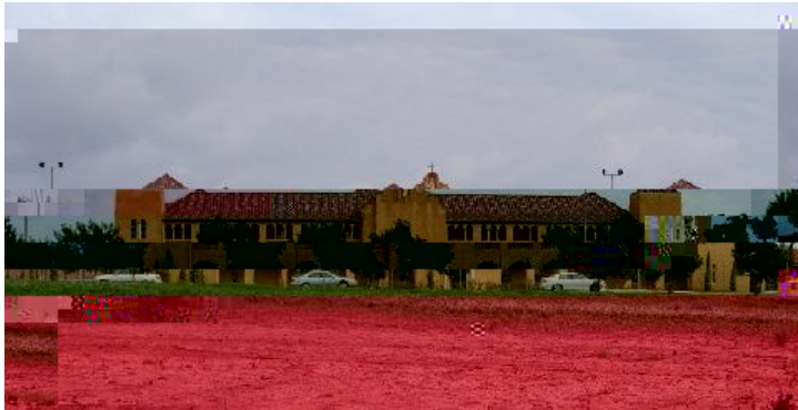
Photo Description: 30/07/2007 Rod Milne East facade of Nazareth House.

Map Reference: 15.2 GPS Northing: 6819716.00 GPS Easting: 267738.000 0000 000