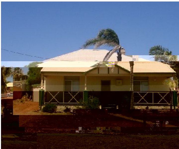
Photo Description: 10/01/2008 Rod Milne Entry gable enhances street facade.

Map Reference: 15.17 GPS Northing: 6817237.00 GPS Easting: 267458.000 0000 000