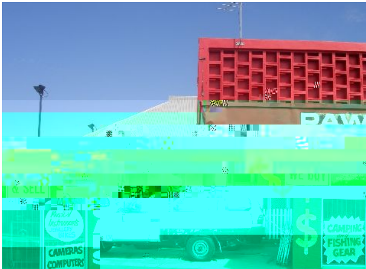
Photo Description: 13/11/2007 Rod Milne Original house set to rear of shop.

Map Reference: 15.16 GPS Northing: 6815187.00 GPS Easting: 267080.000 0000 000