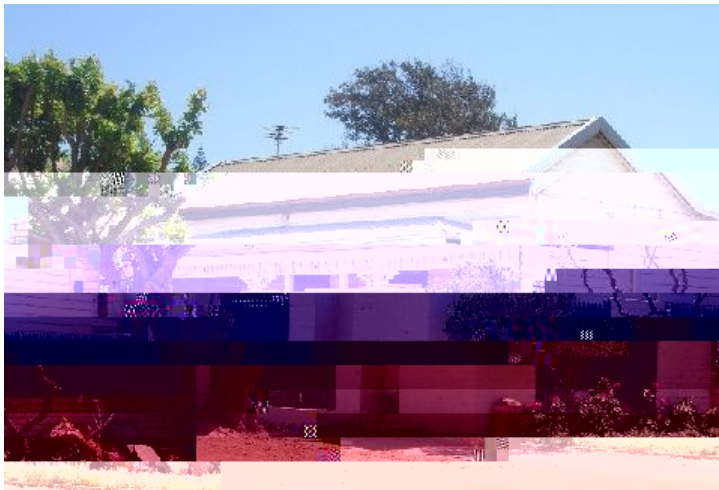
Photo Description: 31/10/2007 Rod Milne Verandah features a decorative timber frieze.

Map Reference: 14.15 GPS Northing: 6814103.00 GPS Easting: 265784.000 0000 000