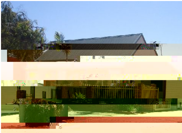
Photo Description: 31/10/2007 Rod Milne View of the house from Burges Street.

Map Reference: 14.15 GPS Northing: 6814148.00 GPS Easting: 265780.000 0000 000