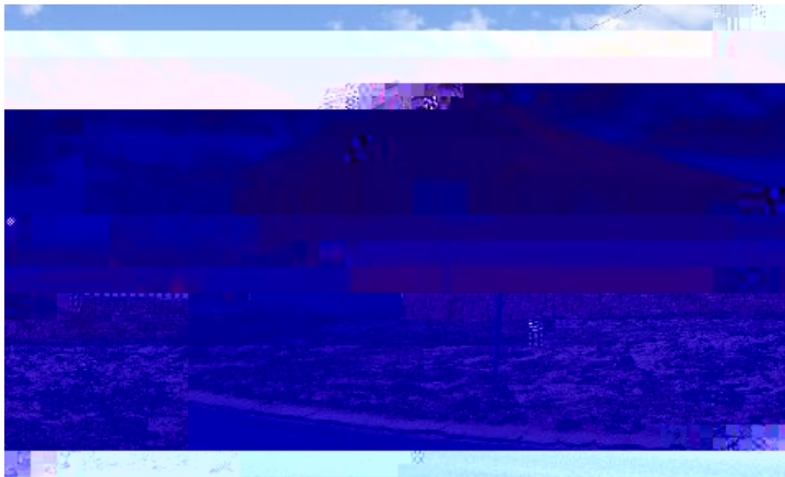
Photo Description: 5/11/2007 Rod Milne House situated in corner location.

Map Reference: 15.16 GPS Northing: 6815221.00 GPS Easting: 267478.000 0000 000