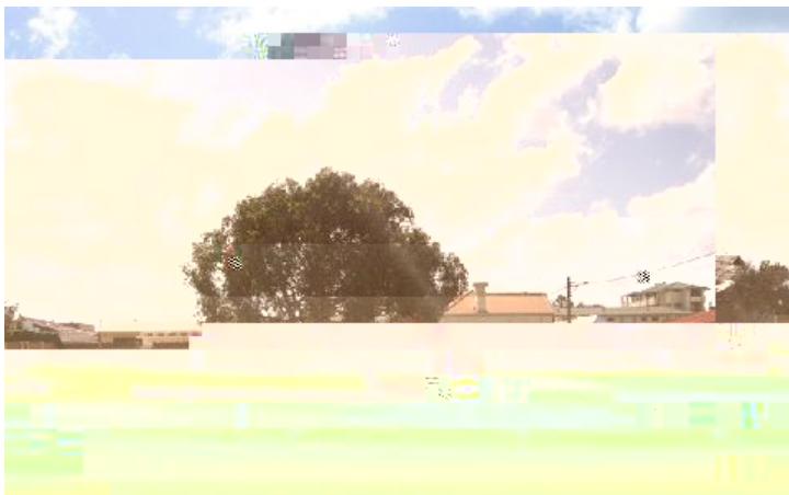
Photo Description: 6/08/2007 Rod Milne View of the park from Augustus Street.

Map Reference: 14.14 GPS Northing: 6814123.00 GPS Easting: 266252.000 0000 000