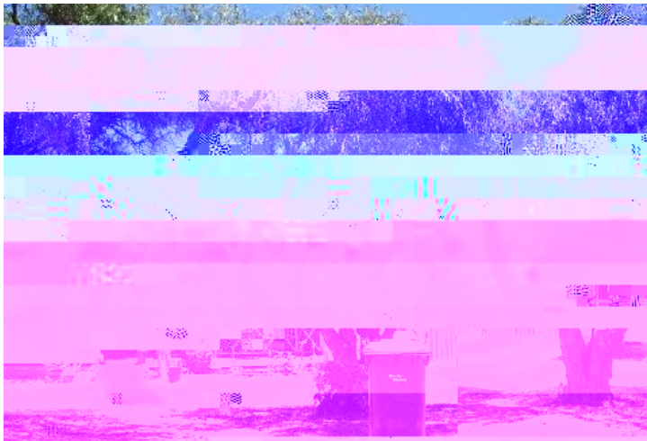
Photo Description: 20/12/2007 Rod Milne View of the house from Augustus Street.

Map Reference: 14.14 GPS Northing: 6813984.00 GPS Easting: 265602.000 0000 000