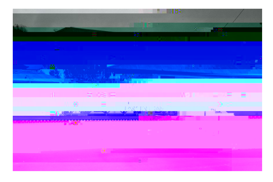
Photo Description: 14/10/1996 Suba & Grundy Basement below footpath level.