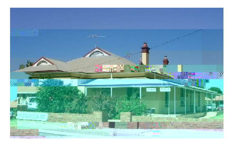
Photo Description: 16/01/2008 Rod Milne Large former house set in spacious grounds.