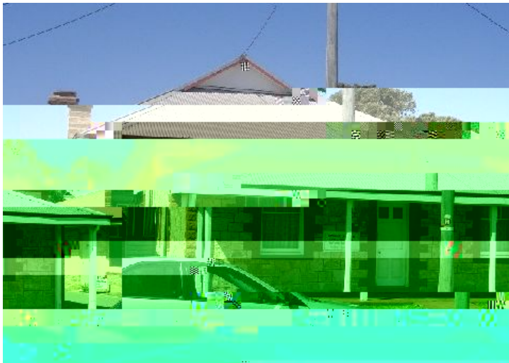
Photo Description: 19/11/2007 Rod Milne Stone building with feature quoining.

Map Reference: 15.15 GPS Northing: 6814967.00 GPS Easting: 267075.000 0000 000