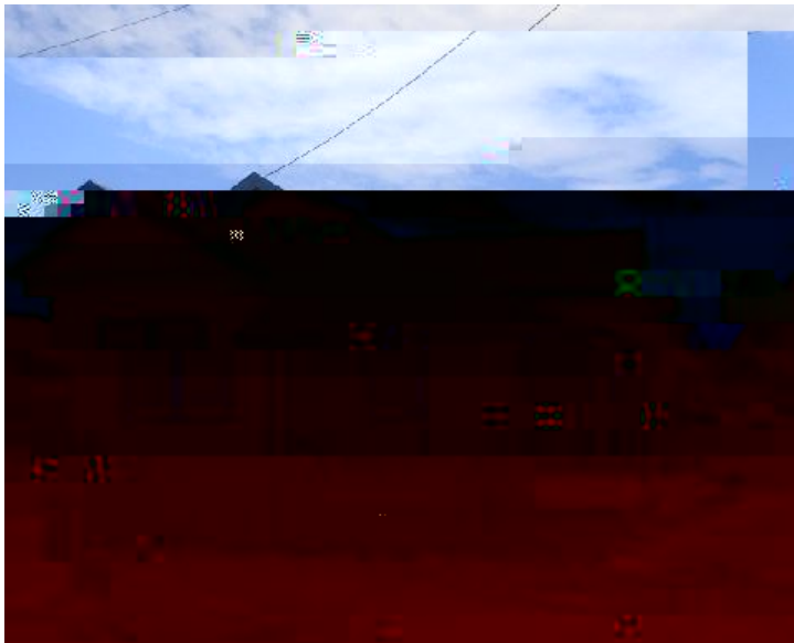
Photo Description: 3/12/2007 Rod Milne Picket fence to street frontage.

Map Reference: 14.14 GPS Northing: 6813621.00 GPS Easting: 266422.000 0000 000