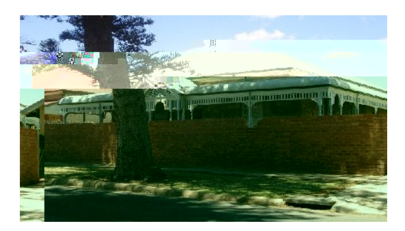
Photo Description: 20/12/2007 Rod Milne Front facade concealed by a high wall.