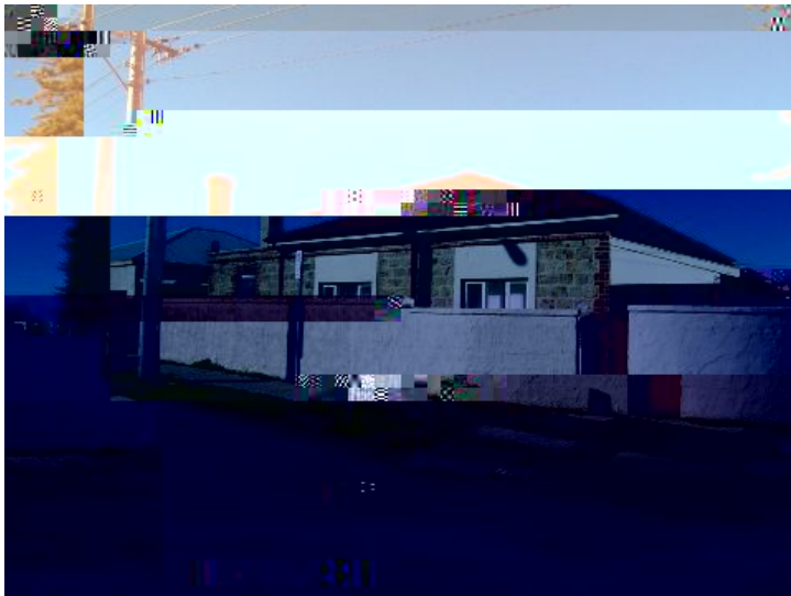
Photo Description: 26/06/2009 Tanya Henkel Stone house set behind a tall rendered wall.

Map Reference: 14.14 GPS Northing: 6814094.00 GPS Easting: 266436.000 0000 000