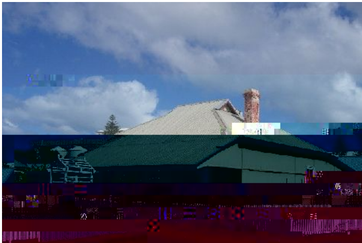
Photo Description: 20/12/2007 Rod Milne The garden setting enhances the house.

Map Reference: 14.14 GPS Northing: 6814069.00 GPS Easting: 265860.000 0000 000