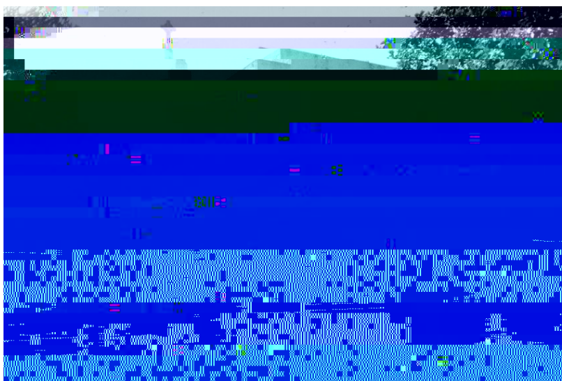
Photo Description: 29/10/1996 Suba, Callow & Grundy Cemetery Chapel of St Spirito.