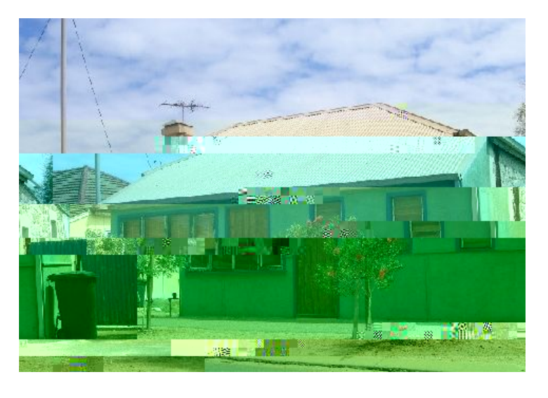
Photo Description: 26/10/2007 Rod Milne Stone walls evident to side of the house.

Map 14.14 GPS 6814087.00 GPS 266064.000 Reference: Northing: 0000 Easting: 000