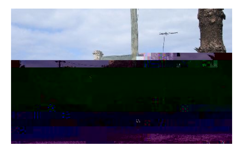
Photo Description: 19/11/2007 Rod Milne View of front facade from Durlacher Street.

Map 15.14 GPS 6814129.00 GPS 267332.000 Reference: Northing: 0000 Easting: 000