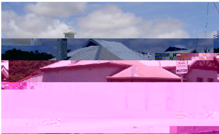
Photo Description: 18/12/2007 Rod Milne Brickwork painted light blue.

Map Reference: 15.14 GPS Northing: 6814736.00 GPS Easting: 266952.000 0000 000