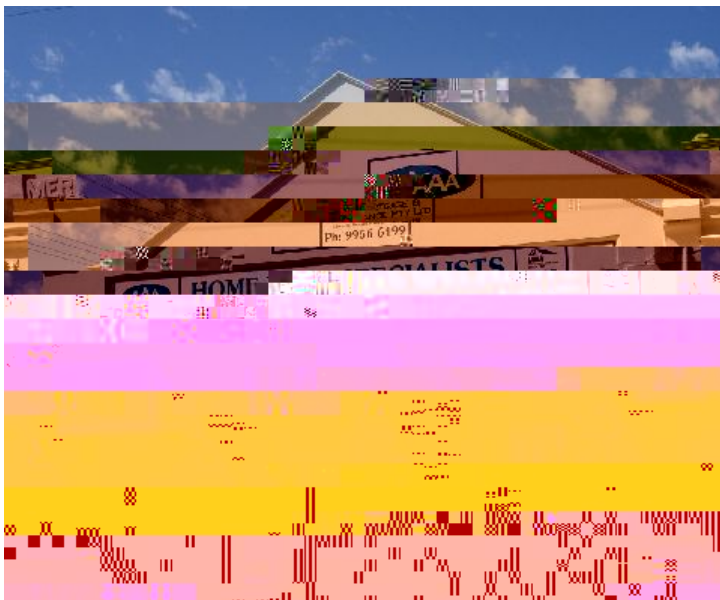
Photo Description: 14/12/2007 Rod Milne Front facade painted white.

Map Reference: 15.15 GPS Northing: 6814791.00 GPS Easting: 266882.000 0000 000